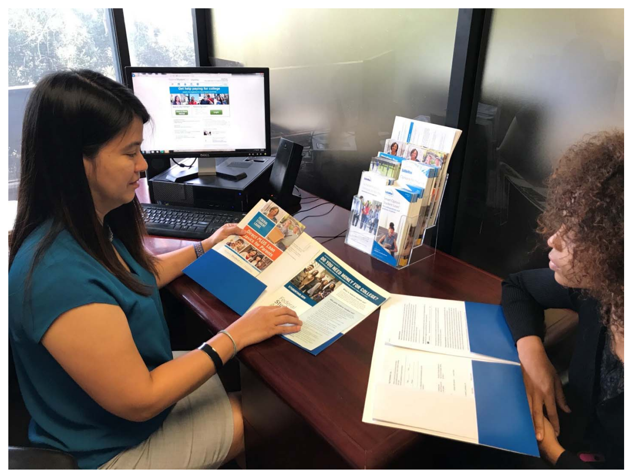
Financial Aid Department