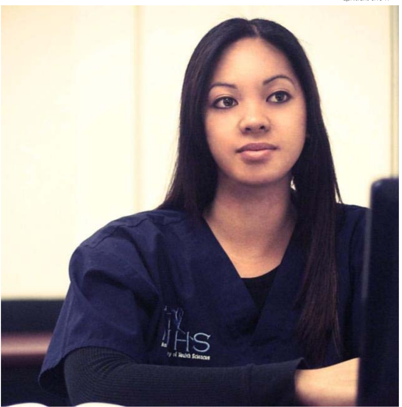
Student, School of Nursing, During Lecture