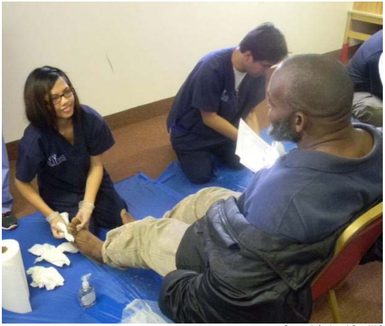
Community Service - A Core AUHS