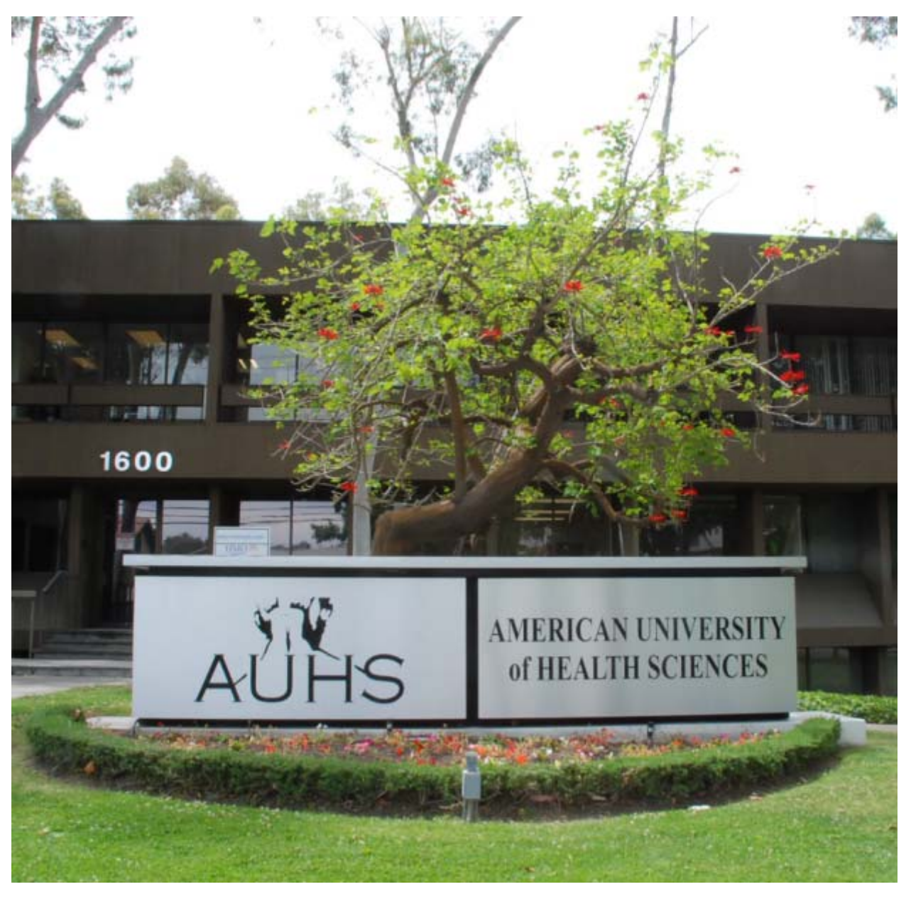
Front, American University of Health Sciences