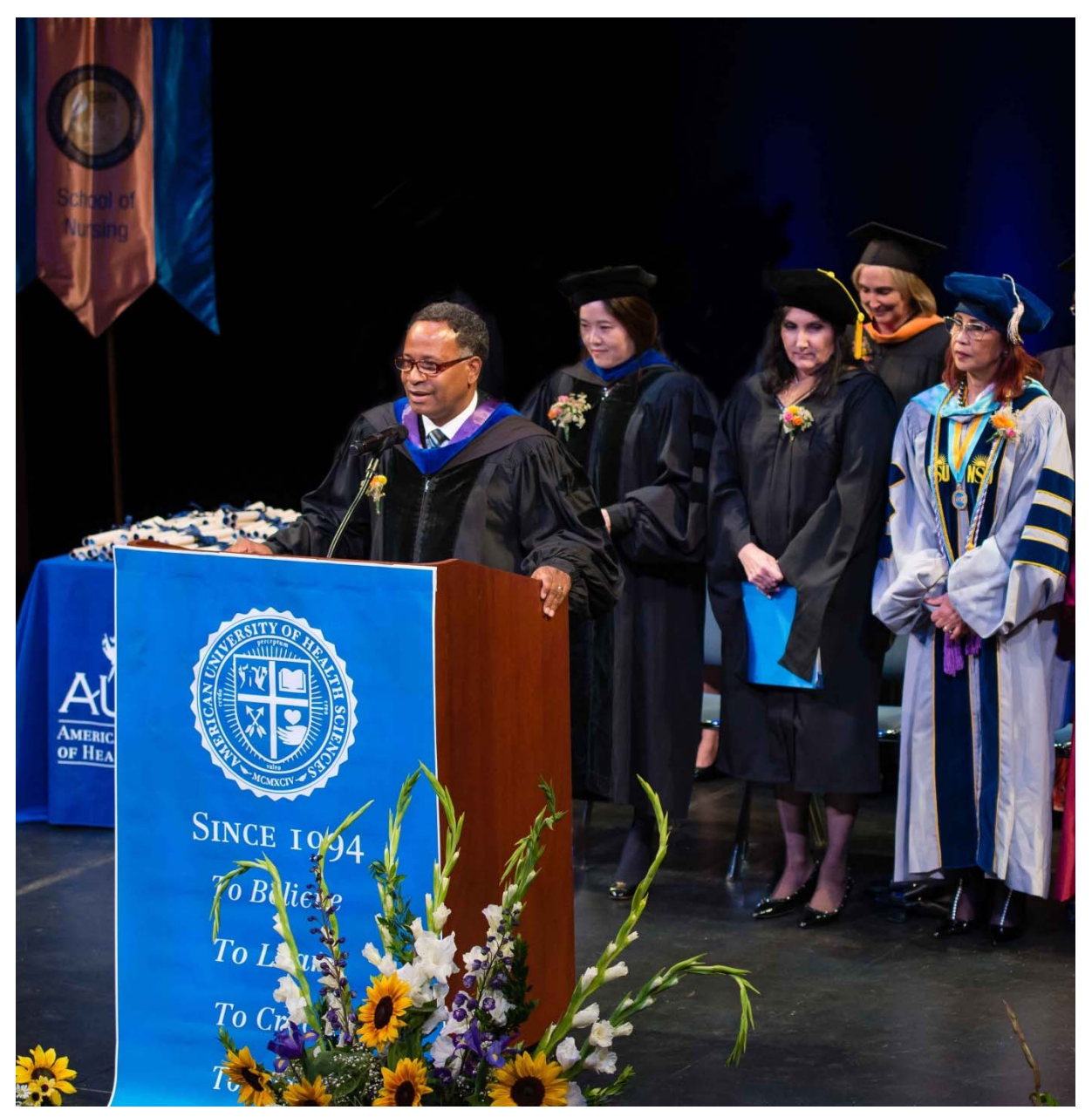
Graduation Ceremony Invocation