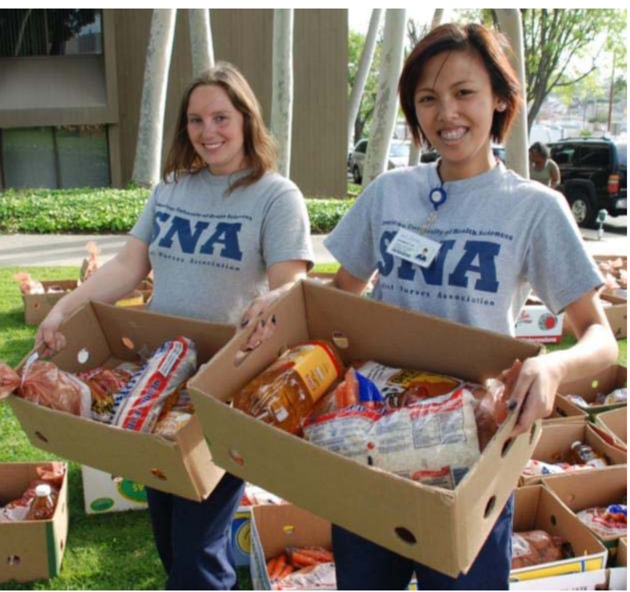
Nursing Students, giving away meals for the "Acts of Love" holiday event

There is a dream that each of us has inside. It speaks of a better time, of a better life, of a better world. There is a voice that comes from God and shows to each, "the way", then say, "come abide." There is a need that cries, must be satisfied, requires of us to care, to help, to give, set self aside. That all might have the chance to believe, to learn, to create, to succeed.