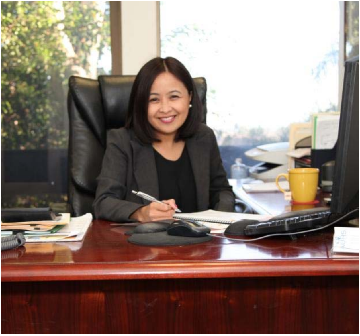
Office of the Students Affairs