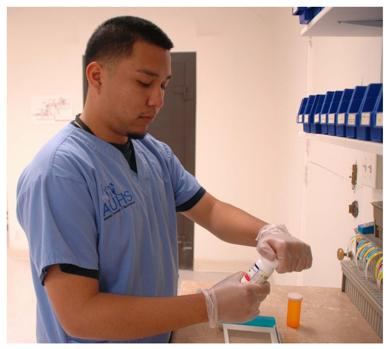
Prescription Dispensing Laboratory